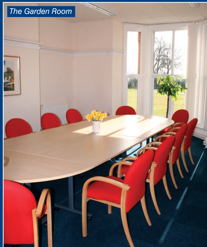
The Garden Room

Field View is based in a peaceful area of Bromsgrove, with easy access to the M42 and M5 motorways and 35 parking spaces available.